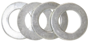
Wheel Spacers (4)