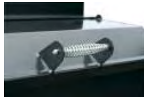
Replacement Spring Ring Handle