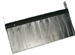
Front Tray with Stainless Steel Cover Marshall

You'll love the look and the extra shelf space with this stylish new accessory for your Rodeo.