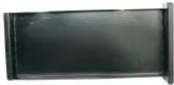
Open Range Replacement Ash Pan