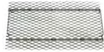
Open Range Replacement Lower Grill Grate