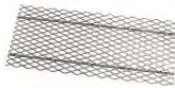
Open Range Replacement Upper Smoke Grate