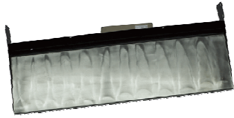
Front Tray with Stainless Steel Cover Rodeo

You'll love the look and the extra shelf space with this stylish new accessory for your Rodeo.