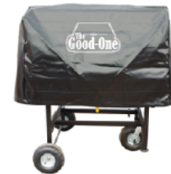
Grill And Smoker Covers Protect your grill or smoker with one of our custom covers.